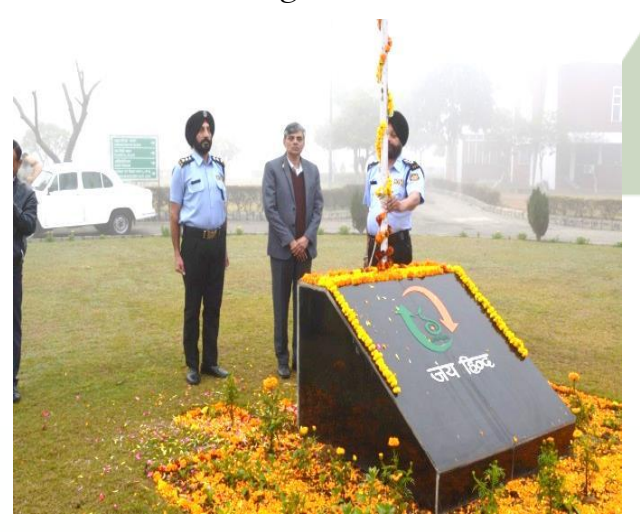
DG, NIBE unfurling the National Flag

The institute actively celebrated the 74<sup>th</sup> Republic Day on 26<sup>th</sup> January, 2023. The Institute's Director General unfurled the flag on this occasion. Following the unfurling of the flag, DG NIBE planted trees in the institute campus. Researchers, NIBE personnel, and their families also organized a cultural event.